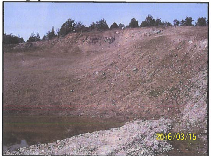
Over steepened area located at the top center of the cut face.