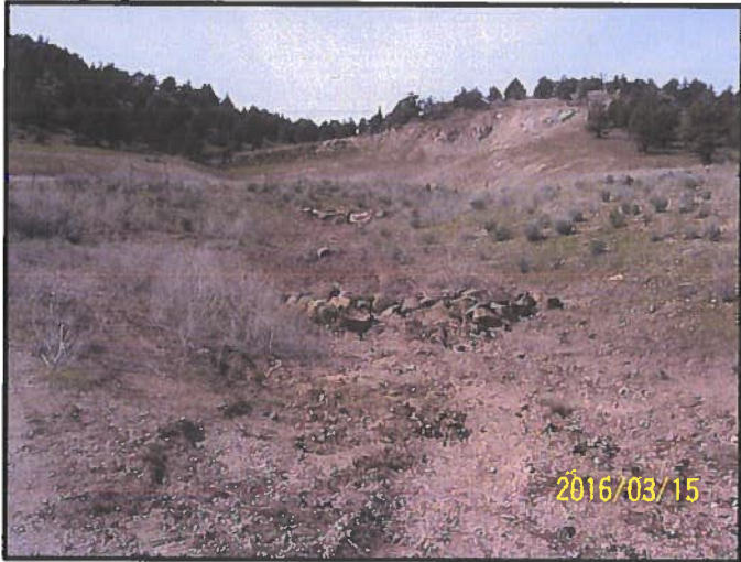
View of erosion control measures completed on the swale.