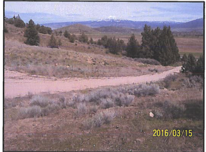
Access roadway into the reclaimed mine site.