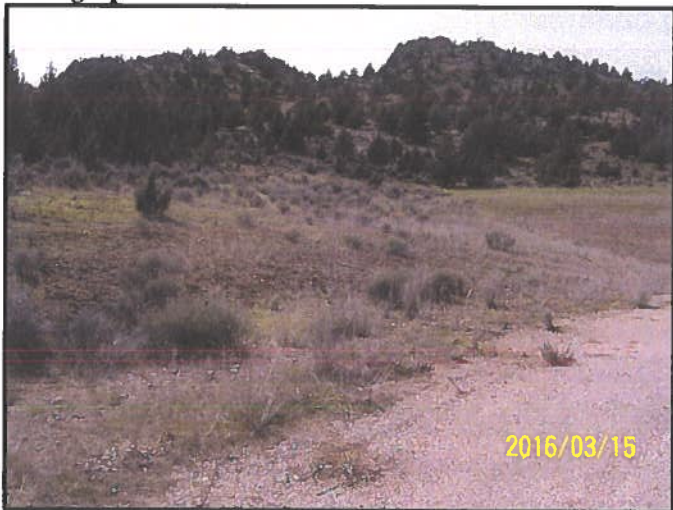
Revegetation results of the Phase II disturbance.