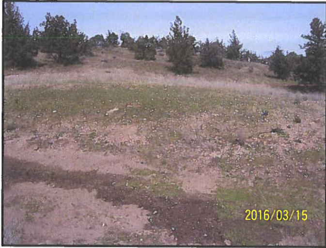
View of a portion of the seasonal swale looking north.