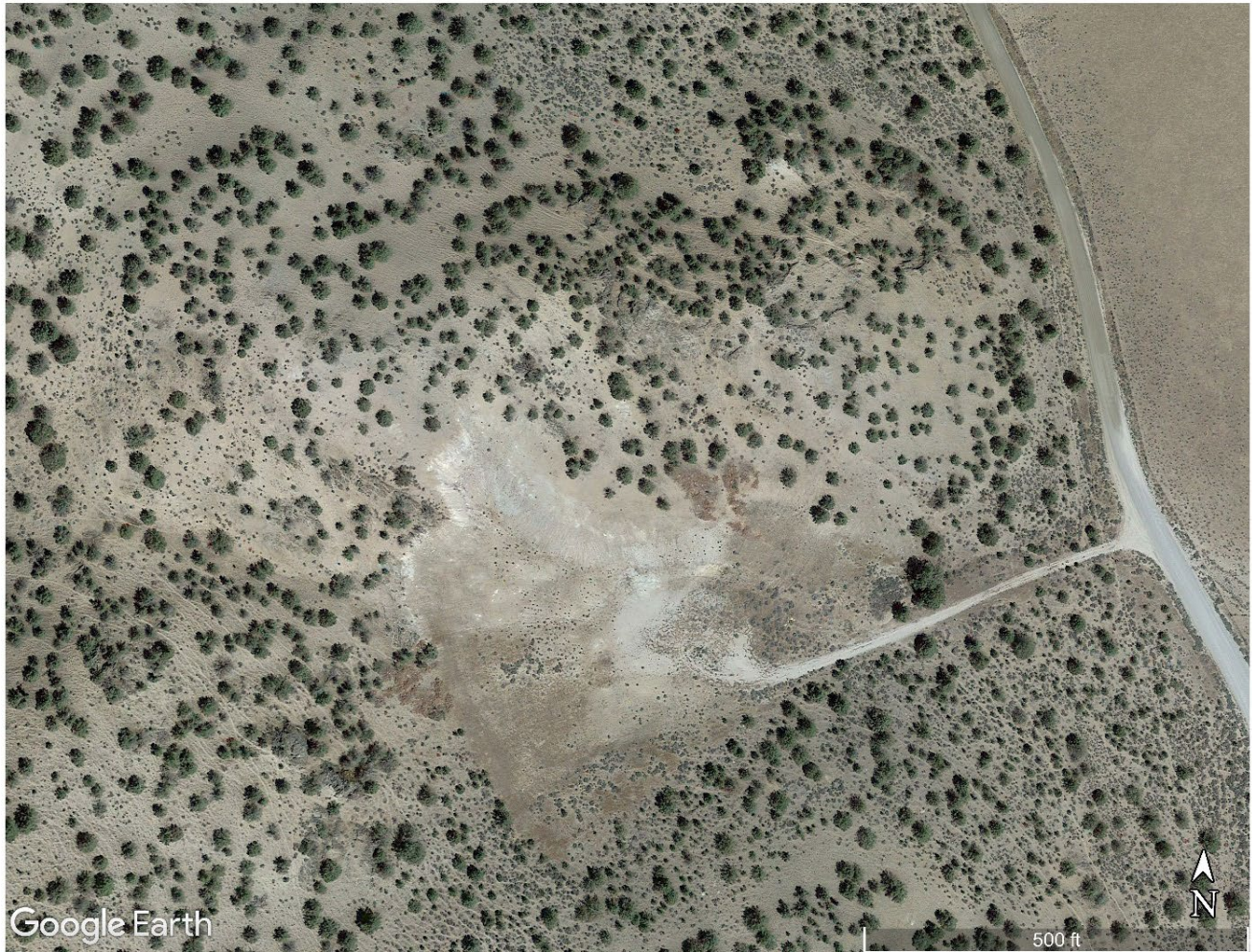
Figure 2: Big Springs Quarry - Aerial Image showing existing site conditions (9/2/2023)